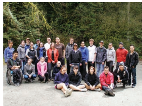
Camp Day was held at Camp Capilano in North Vancouver, B.C. The day is set up to allow the graduating diploma students to wrap up their two-years of study in an outdoor setting.

The internships wrapped up nicely with the student Camp Day at Camp Capilano in North Vancouver, followed by the Annual Internship Luncheon held here at Langara College. Some interns will be staying at their agencies for employment, while others will be looking for permanent work in the field. We are pleased to announce as well that some are planning to return here to Langara to pursue their Bachelor of Recreation Management Degree.