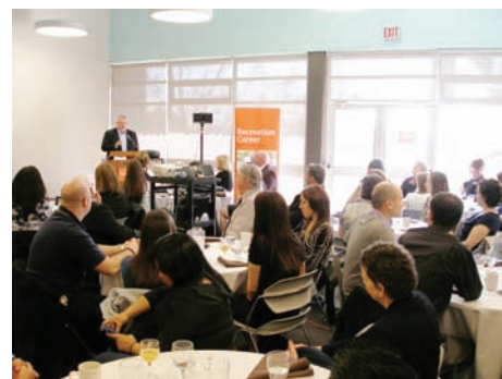
The annual Internship Luncheon held at Langara College is a way to thank the various Internship Agencies and other people associated with the program in a formal way. The spring scholarship presentations for the program are also done at this event.