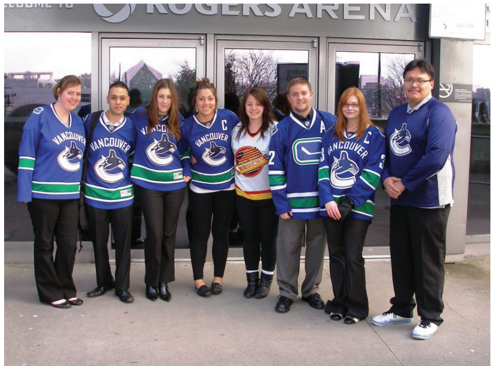
The first-year diploma students wore a variety of Canucks jerseys during their second term tour of Rogers Arena in Vancouver.

During their second term of study (January to April) the first-year students were kept very busy. Included in this term were courses in Recreation Program Planning, Personal Portfolio Development and Seminar, English or Communications, Applied Psychology, Valuing Diversity in Leadership, and Applied Skills in Recreation Operations. Supplementing the "in the classroom" material for the operations course were a number of field trips to major facilities in the Vancouver area. These included Mount Seymour, Shaughnessy Golf and Country Club, Rogers Arena, and Queen's Park Arena in New Westminster for the 25th annual Recreation Students' Custodial Lecture and Competition.