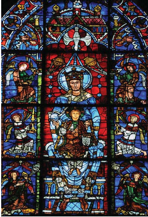
Figure 3. Notre Dame de la Belle Verrière (detail) Cathedral of Notre-Dame, Chartres, France, ca. 1170. Stained-glass window. Approx. height (4.27m).