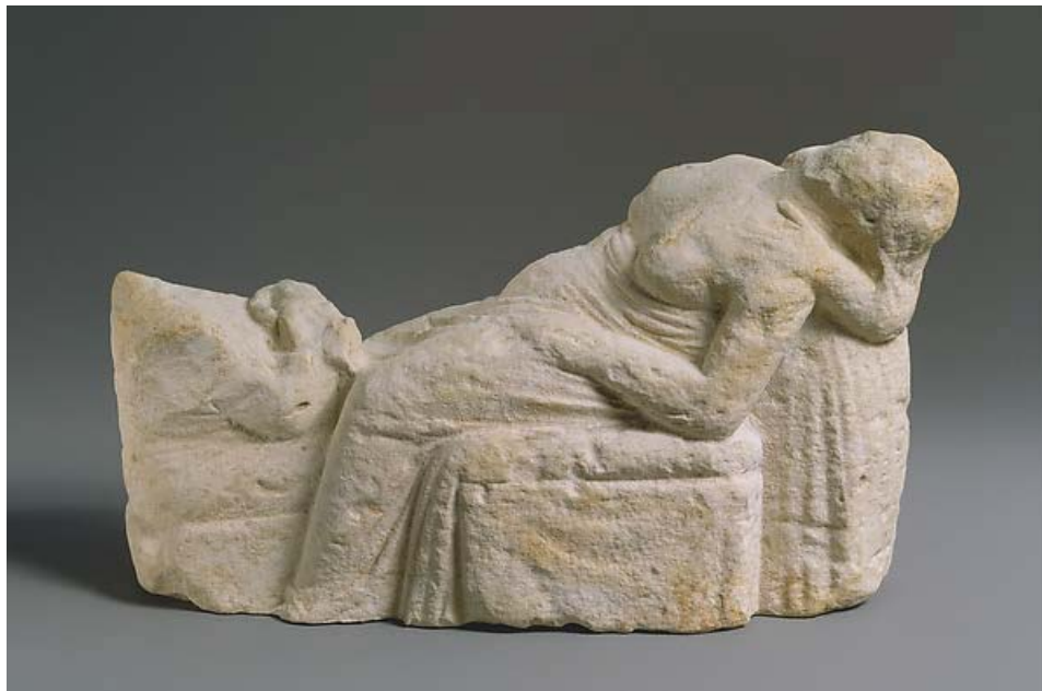
Figure 1: “Limestone statuette of a childbirth scene.” 310 B.C.E-30 B.C.E H. 16.5 cm; W. 25.1 cm. The Metropolitan Museum of Art. Accession no. 74.51.2698 https://www.metmuseum.org/art/collection/search/242249