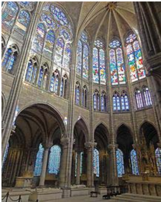
Figure 2: Apse, Abbey Church of St. Denis, Paris, France.