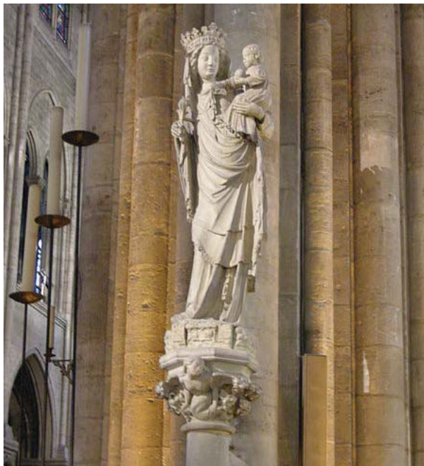
Figure 8: "Virgin of Paris," Cathedral of Notre-Dame, Paris, France. 14 th century. Stone.