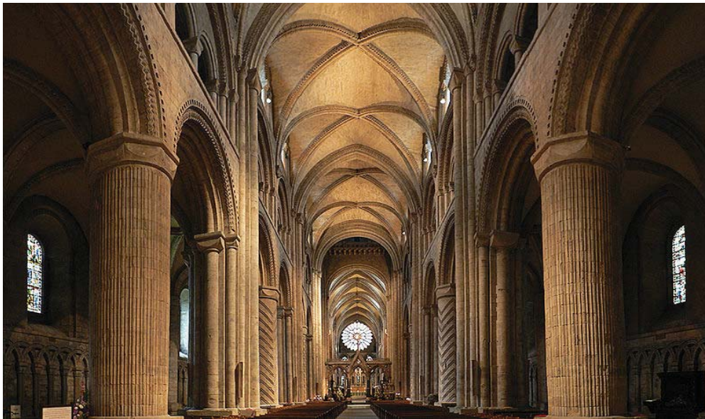
Figure 4. Nave, Durham Cathedral, England. 1093 – 1130.