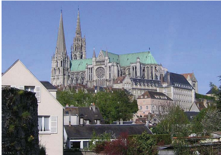
Figure 1: Cathedral of Notre-Dame, Chartres, France (from the south)