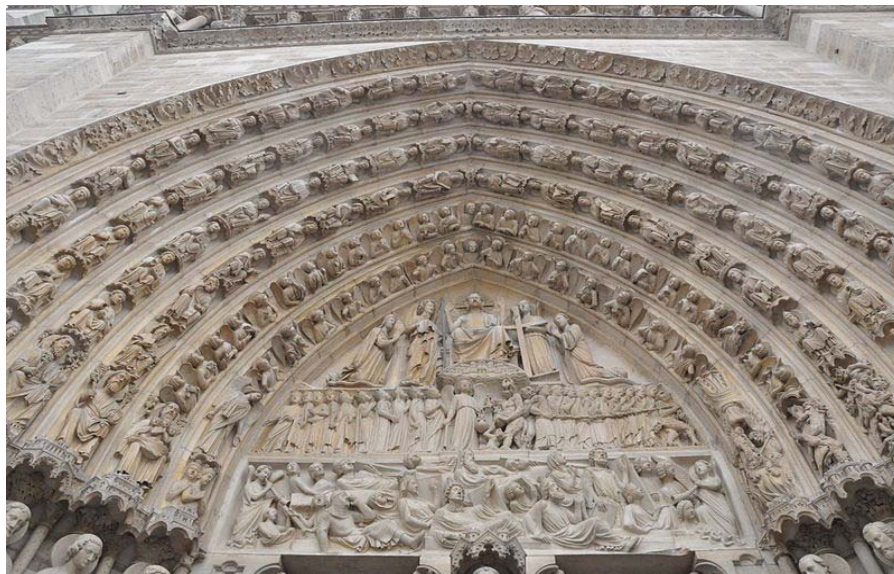
Figure 6: Last Judgement tympanum, central tympanum above the portal of the west façade, Cathedral of Notre-Dame, Paris, France.

https://commons.wikimedia.org/wiki/File:Autun_St_Lazare_Tympanon.jpg (accessed January 10, 2018)